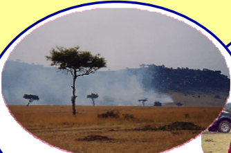
Ore empejoto olkeek naa keishu nkujit naanya nkishu inyi

Kiyieu nikiyiolou intokintin naitanyamalita intai