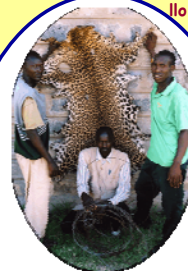
kesotu sii irresheta oibungie iltungana nguesi, naa torrok sii ninche too nkishu

Ilo turrur esiani oltungana, nkishu oo nguesi te Mara